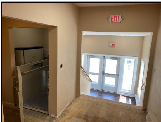
Looking out the new parking lot entrance

If you would like to make a gift to the Capital Improvement Fund, to offset the costs of renovation, you can do so by mailing a check to the church office (SGUMC, 176 Main St, Sugar Grove, IL 60554) or by visiting our website ( www.sugargroveumc.net ) and selecting Capital Improvement Fund.